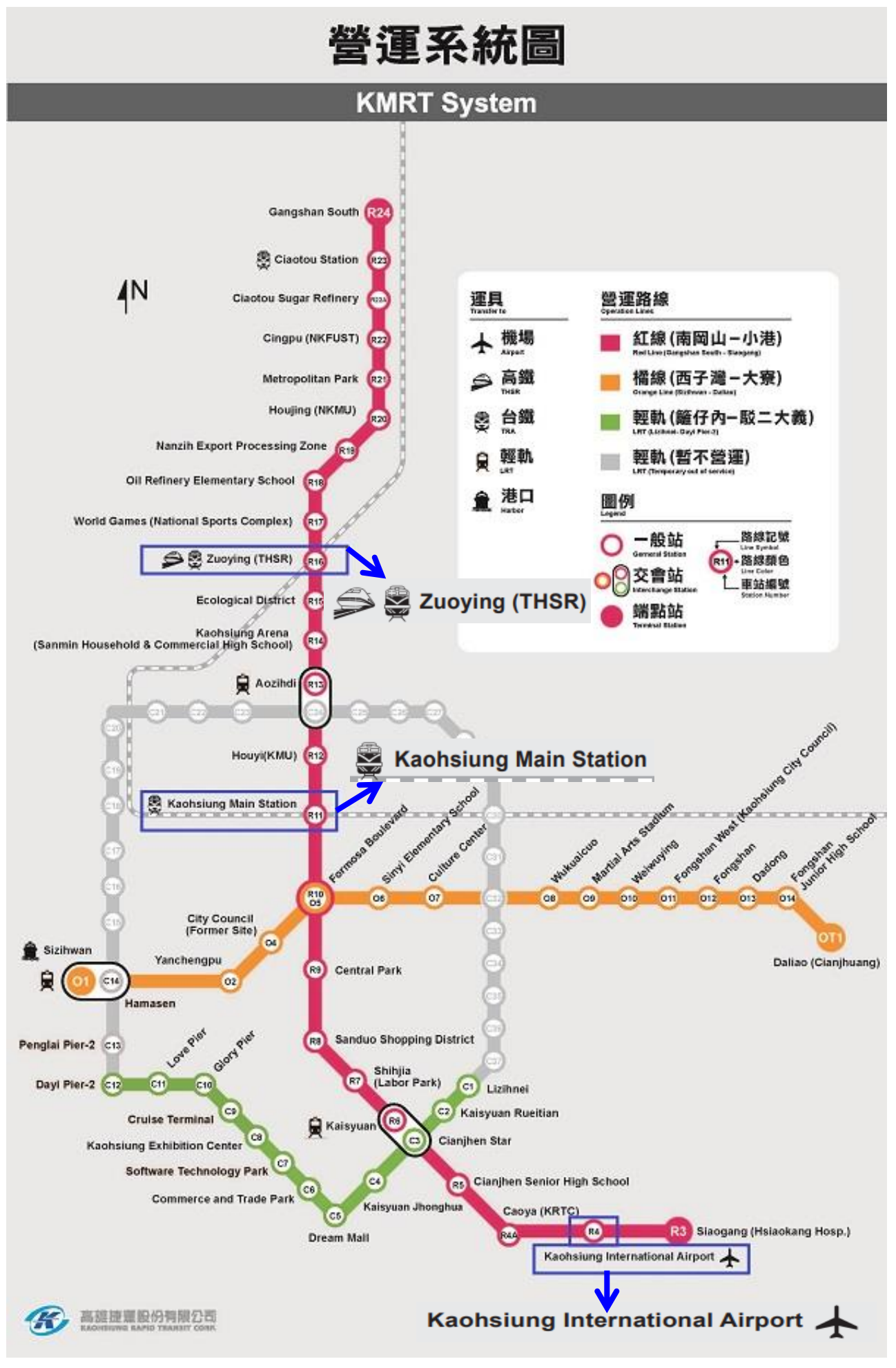
Fig. 1: KMRT System